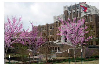
Little Rock Central High School "The Most Beautiful High School In America"